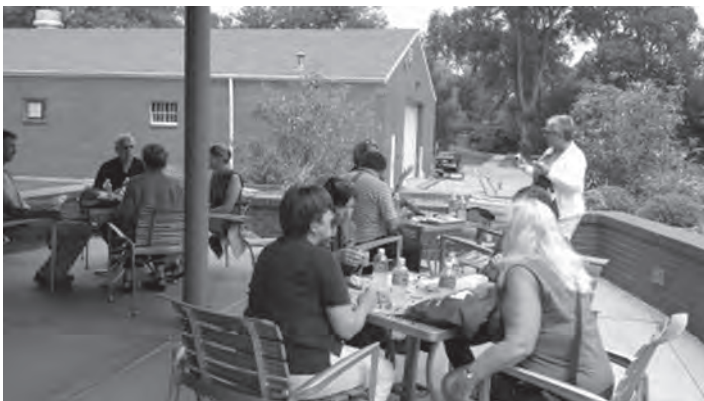
4 Lunch at the "The Bistro" at Metro Community College.