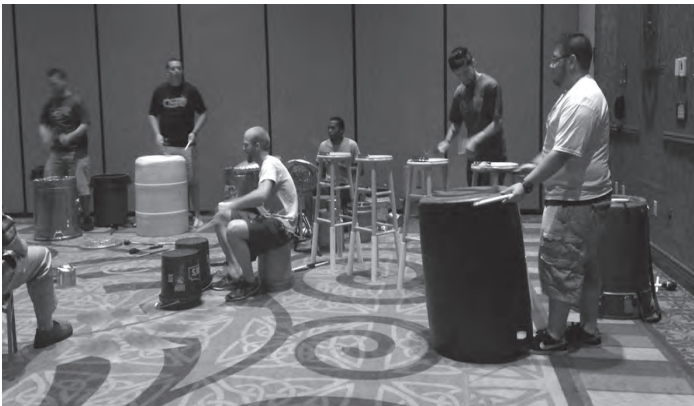
Omaha Street Percussion Band entertaining the group.