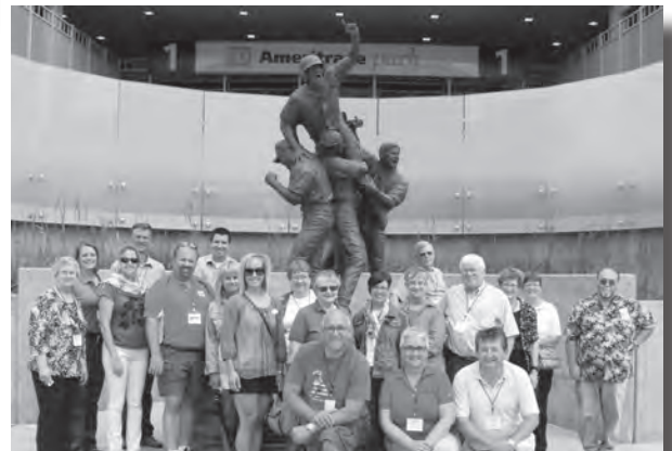
Group picture at TD Ameritrade Park.