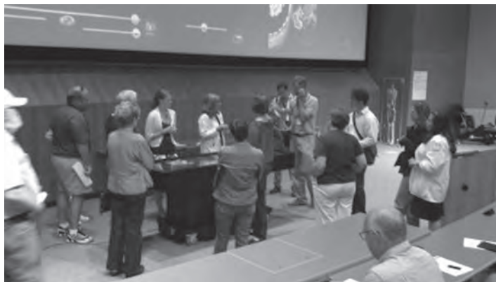
Members of our group viewing the Anatolmager at UNMC.

The University of Nebraska Medical Center was another stop for us. While there we learned about the research taking