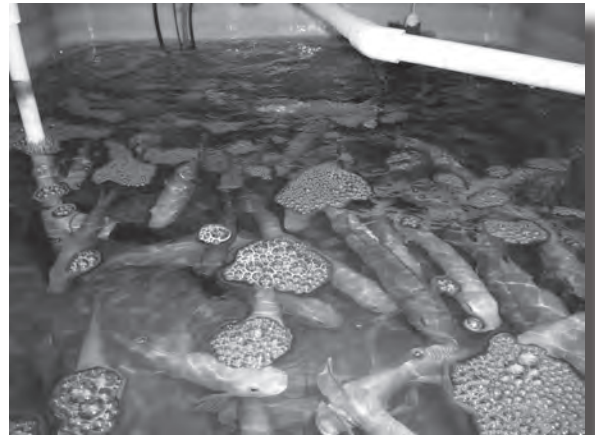
Tilapia grown in the Auqaponics tank at Metro Community College.