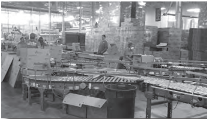
View of the production floor at Outlook Nebraska Inc.

ONI – Outlook Nebraska Inc. is a manufacturing company in Omaha with 68 associates employed there,