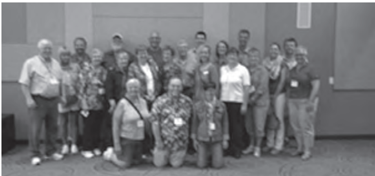
Our 2014 Reverse Ag Tour Group.