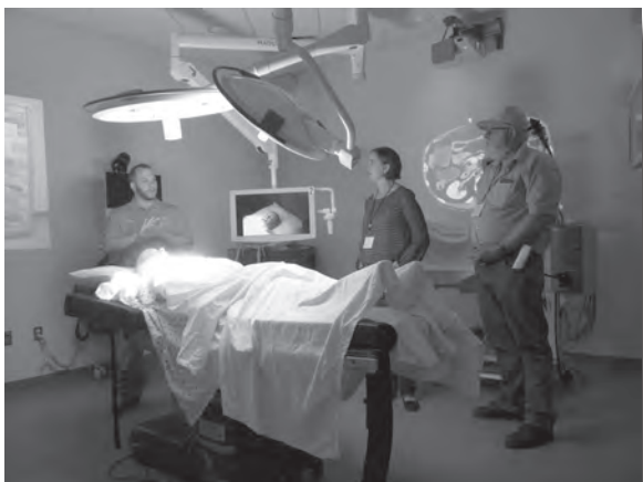
Simulation Room Demonstration with atomically correct model at UNMC

place there. UNMC has a presence in 120 communities in Nebraska. They currently have 3,840 students enrolled and approximately 5,000 employees. They have been recognized as 6th in the nation for primary health care and 12th in the nation for rural health