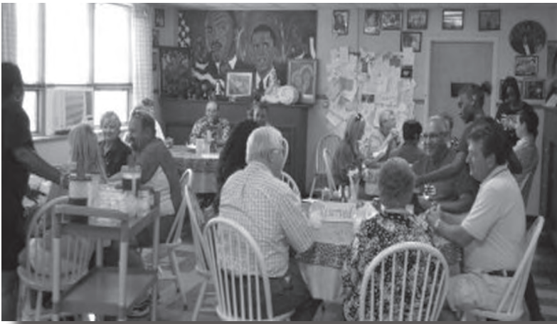
Lunch at "Big Mama's"