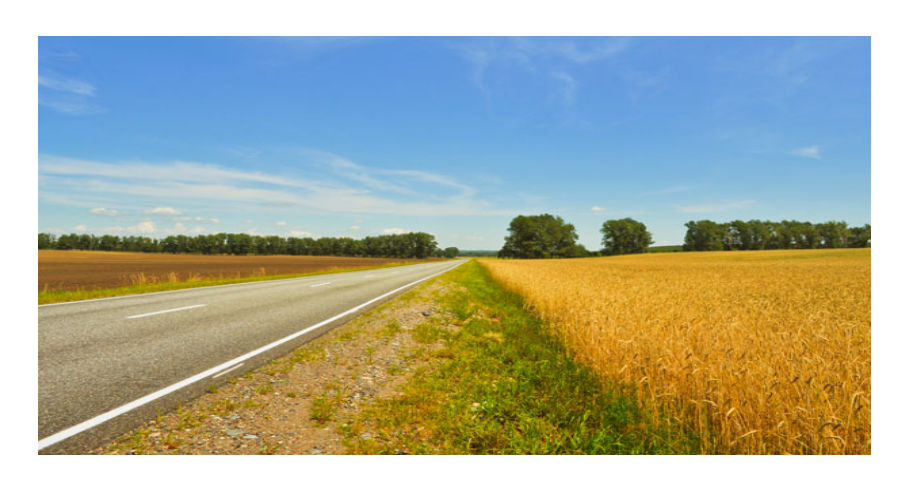
Join Us for the "Agway on the Byways" 2015 Ag Adventure Tour, July 9-11, 2015