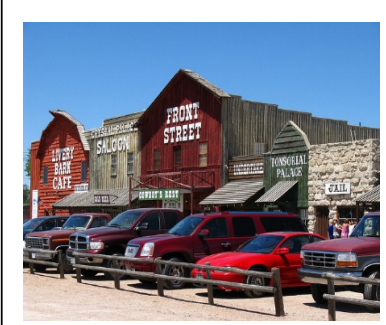
Front Street - Ogallala

Where: Grand Island, Ravenna, Halsey, Thedford, Ogallala, North Platte, Lexington, York. Overnight at home stays July 9, Stagecoach Inn in Ogallala July 10.