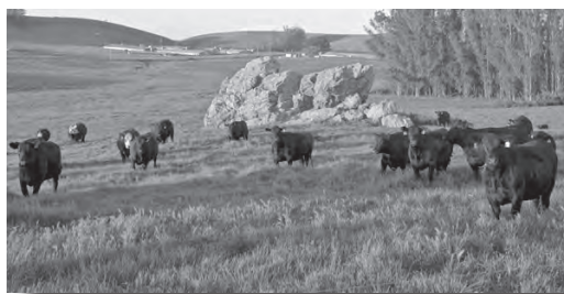
Stemple Creek Ranch