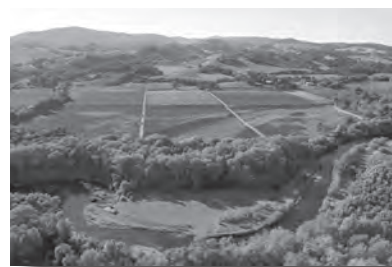
Russian River Valley