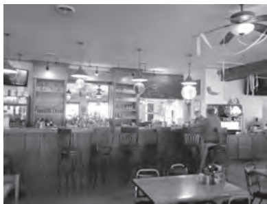
Chex Bubba Cafe

From Seward we plan to travel to the Bayer CropSciences Research Nebraska Station near the Goehner Exit off of Interstate 80. The goal at the Station is to turn a 10-year, $1 billion investment into wheat varieties that are not only more productive, more tolerant of extreme weather and disease-resistant, but are also indistinguishable from wheat used now to make food products such as flour. They are also researching new soybean varieties. While there we will hear from the researchers, see the crops being tested and tour their greenhouse facilities. http://www.omaha.com/money/with-new-nebraska-facility-and-unl-s-input-bayer/article_dd5185ed-267a-5811-b3f2-db279c10e7e6.html