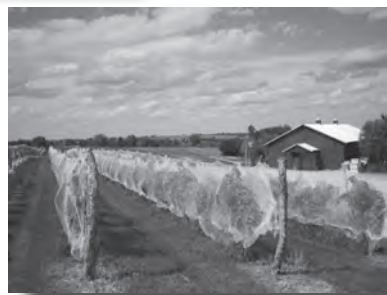
Junto Winery and Vines

As you can see from our two day event – there really IS something to see and do as you travel Interstate 80!!!! We hope you will join us.