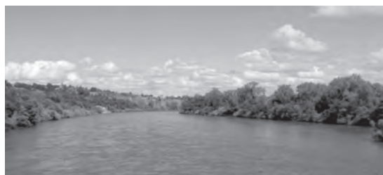
8 Recharge Lake - Project Grow

We will be stopping in York next to visit the Upper Big Blue NRD offices. There we will hear from representatives from the NRD and AmeriCorps about their joint projects. We will drive to the York wellfield to tour the “Project Grow” endeavor taking place, the first one in Nebraska. They are developing a crop production and pollinator program at the wellfield. The long term goal of the project is to improve the soil and water conditions of the wellfield and provide a program which can be replicated throughout other areas of the state and nation. We will also travel to Recharge Lake to learn about the NRD reclamation project taking place there. https://www.upperbigblue.org