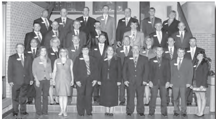
Congratulations to the graduates of LEAD, Class XXXVI.