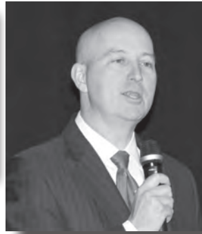
Governor Pete Ricketts, 2018 Conference Keynote.