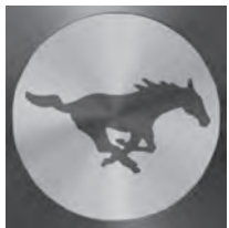
Home of the Mustangs