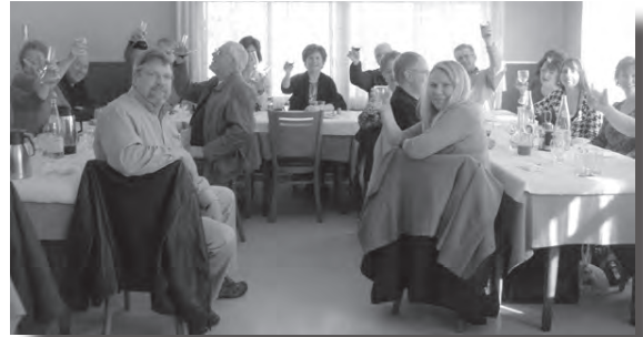
Spain/Portugal International Travel Study.