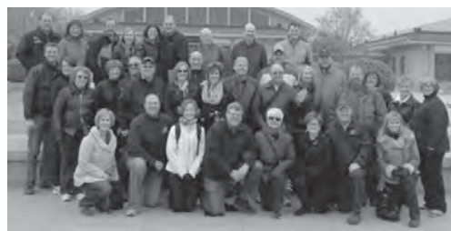
Travel Seminar to China, Terra Cotta Warriors.