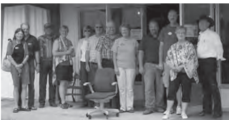
Board of Directors touring Stuhr Museum.