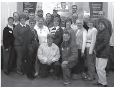
California National Travel Study group.