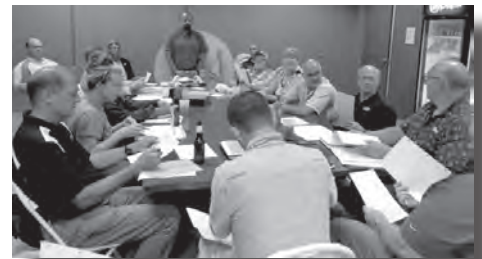
NE State Fair Reception.