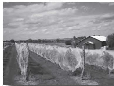
Junto Winery and Vines

Our final stop of the day will be at the Junto Winery near Seward. Their advertising states “Growing grapes in Nebraska puts you at the mercy of Mother Nature, but the risk is worth the reward.” Known for their dry wines (not generally found in Nebraska wineries) and their Ben Franklin memorabilia, Junto winery is a great final destination for our tour. https://www.juntowine.com/