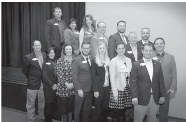
LEAD XXXIV Conference Committee.

If you attended the conference, I hope you were able to pick up on the theme of change to which our chosen speakers talked about. I also hope you were able to reflect individually as to what you may need to do to adapt to some of the upcoming changes discussed. Changes in Agriculture. Changes in Nebraska. Changes in our world. Changes in our own lives. Will you be able to adapt and find ways to keep moving forward? One of most memorable talks of the conference was hearing a personal story of a fellow LEAD XXXIV member and her family's unexpected life change since graduating the NE LEAD program. Her and her family's story of turning their hardship into a suc-