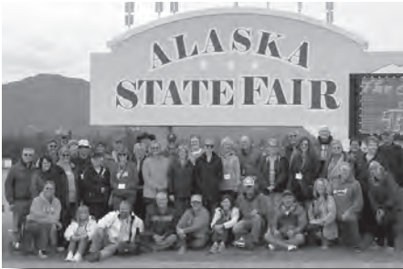
Alaska National Travel Study Seminar group.