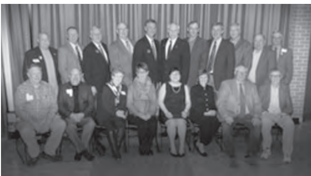
LEAD Class VI