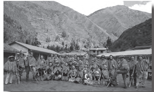
Peru International Travel Study.