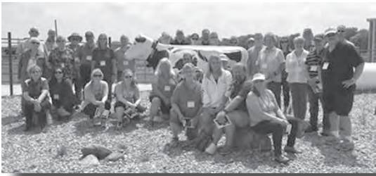
Ag Adventure Tour Group 2017.