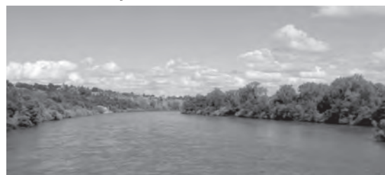
Recharge Lake - Project Grow