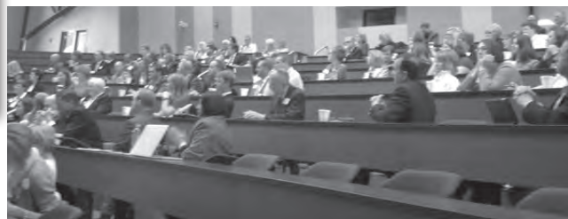
Leadership Summit in session.