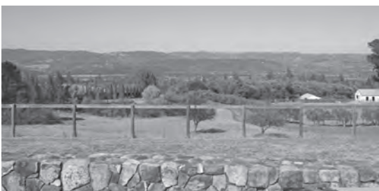
Long Meadow Ranch

The California Seminar is looking to be a great time. The farms and ranches we are scheduled to visit are as much an interwoven aspect of the Russian River Valley as grape growing and wine making. I am excited with the varied schedule of tours and sights, as there is surely something for everyone!!