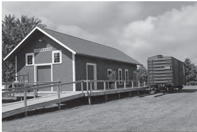
Depot at Henderson Heritage Park.