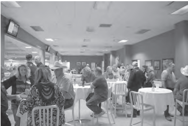
Good food, adult beverages and great conversation.

A good time was had by all at our annual reception during the NE State Fair. It's a great time to get together, rest from the activities of a day at the fair - and just catch up with each other.