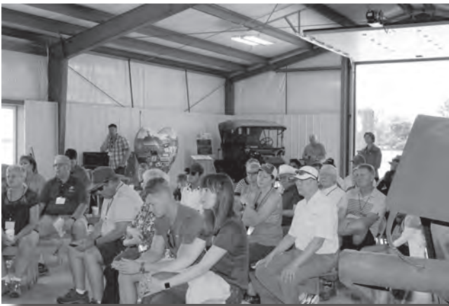
Group listening to a discussion on irrigation development - Henderson.