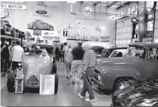
Touring the Klatt Museum at the Hastings Motorsport park.