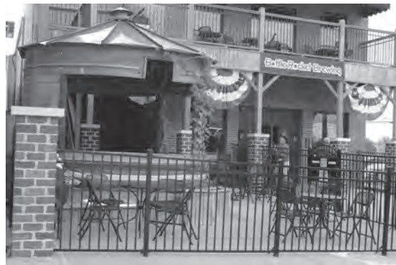
The Bottle Rocket Brewing Company in Seward was our second tour stop.