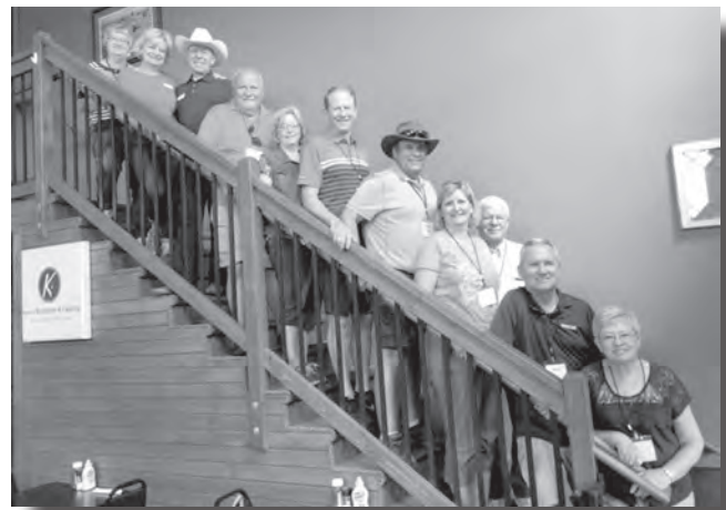
LEAD Alumni attendees at Kerry's Restaurant in McCool.