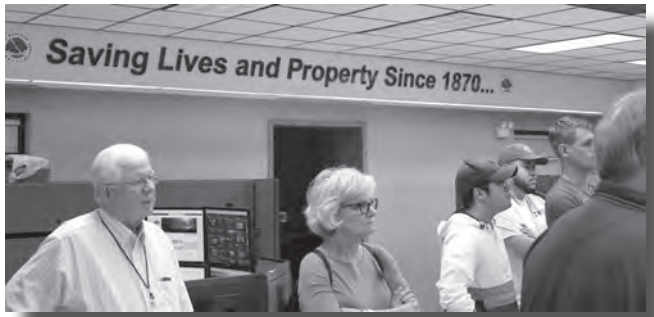
U.S Weather Station group - note the signage!