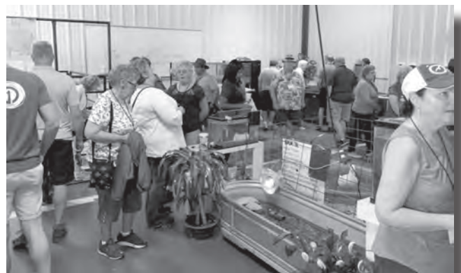
Animal Barn at McCool Junction Public Schools.