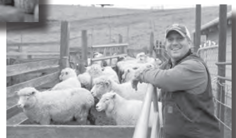
Stemple Creek Ranch