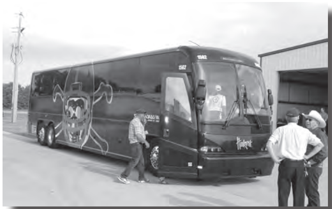
Our tour bus.