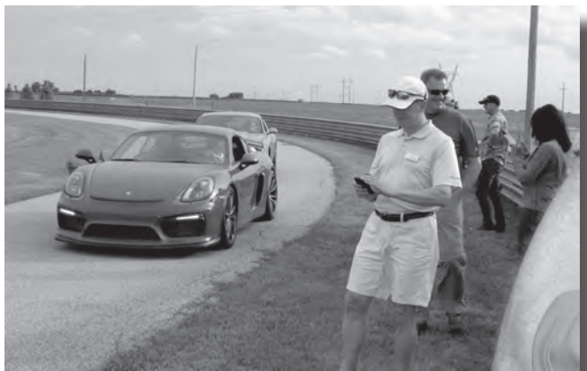
Lining Up to take a spin around the Racetrack at MPH.