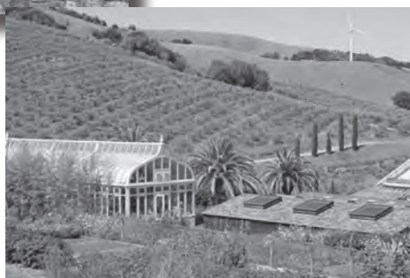
McEvoy Ranch Olive Farm