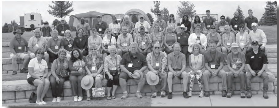
Group picture taken at Recharge Lake in York.