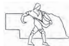
Nebraska LEAD Alumni Association