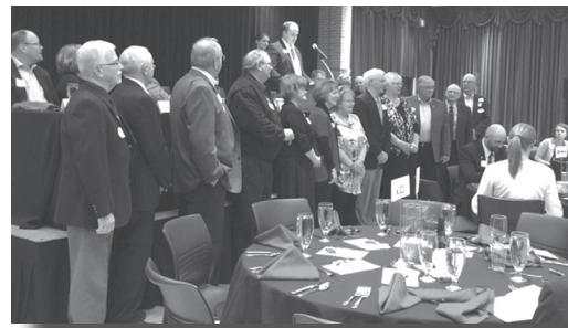
Pictured are members of LEAD Class VII who were honored at the LEAD Graduation and Honors Banquet in Lincoln on March 15, 2019.

Check out our website at http://www.neleadalumni.com