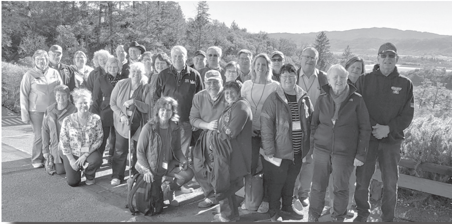
LEAD Alumni at Rutherford Hills Winery.

polo Winery, McEvoy Olive Ranch and Olive Mill, Tara Firma Farms, Toluma Farms and Tomales Farmstead Creamery, ZaZu Kitchen, Golden Gate Bridge, San Francisco and Alcatraz.