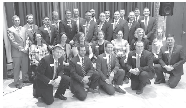
Congratulations to graduating LEAD Class XXXVII - Can't wait to welcome you to our Alumni Association!