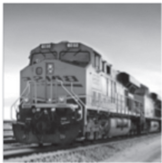
Burlington Northern today

At the railyard we will have a tour of the shop area where the locomotives are being repaired. We will see the drop table used to change out wheels and the heavy area to change out engines. We will also hear the "history" of this railroad yard. http://www.bsnf.com