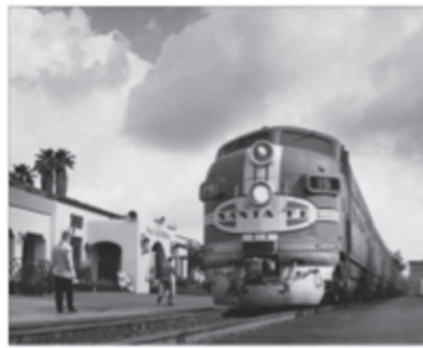
Santa Fe Vintage "Super Chief" Engine