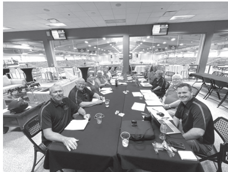
The Board of Directors at work for you!