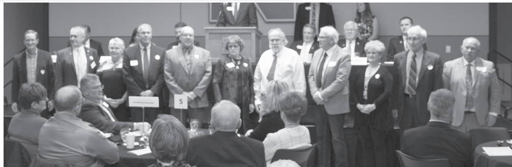
LEAD Class IX