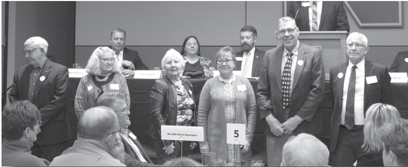
LEAD Class VIII

Each year the NE LEAD program recognizes and honors a former class of graduates from the program. This year’s honorees were LEAD Classes VIII, IX and X!