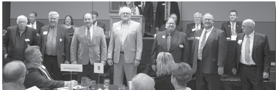
LEAD Class X