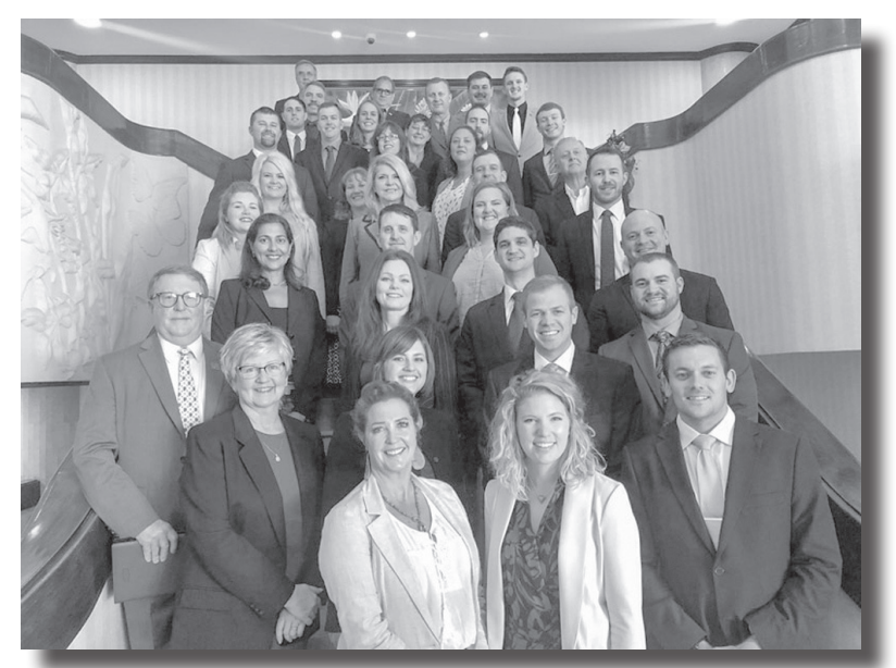
LEAD 38 members at USA Embassy and CATIE Inter-American Institute (Latin America Regional Center).